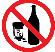
Under the influence of Drugs or Alcohol